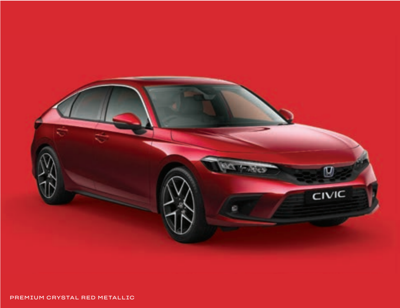
PREMIUM CRYSTAL RED METALLIC

Express your personality and choose from our range of colours that complement the Civic's dynamic styling perfectly, such as Platinum White Pearl and Premium Crystal Blue Metallic.