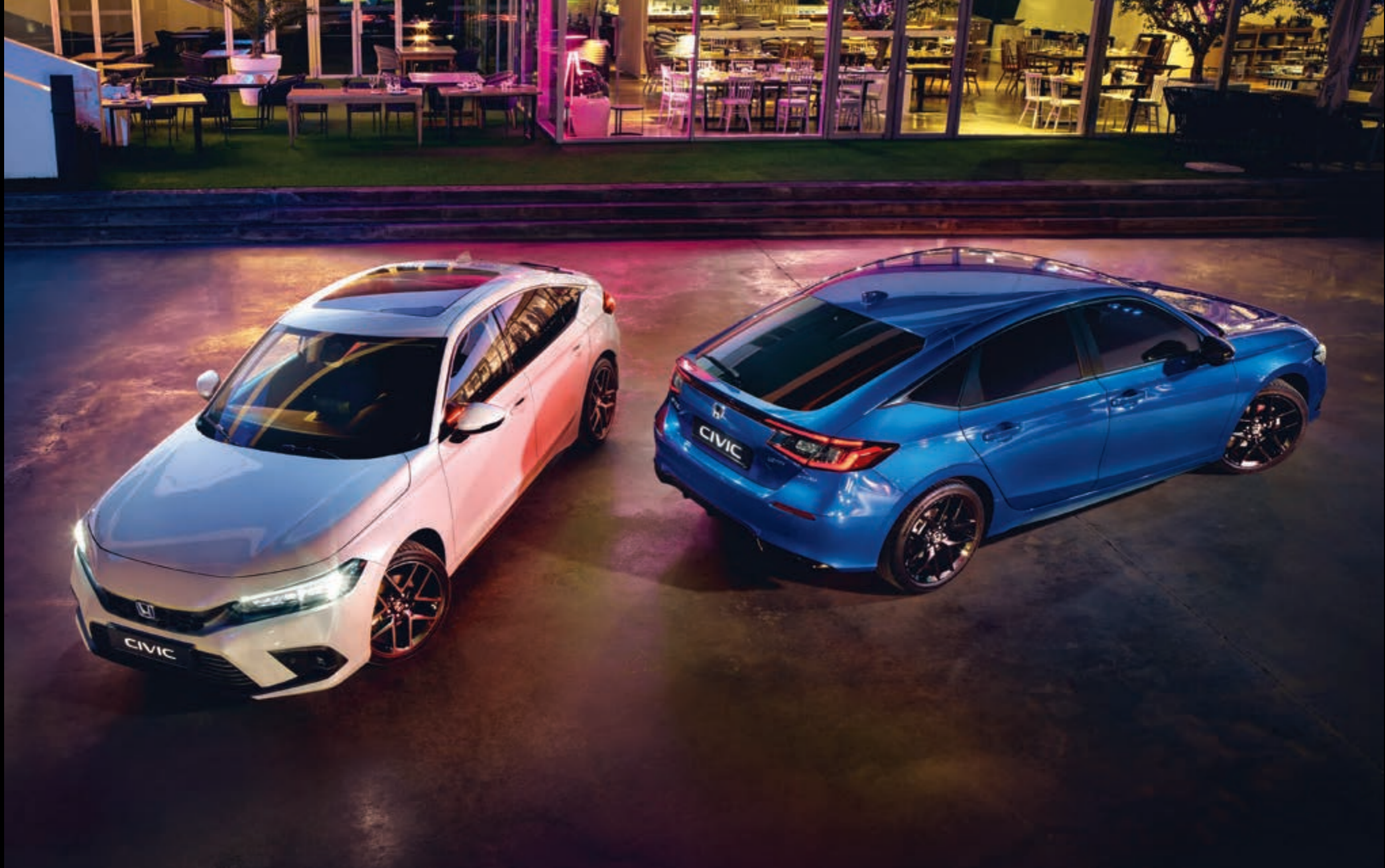
Models shown are the Honda Civic 2.0 i-MMD Hybrid Advance in Platinum White Pearl and the Honda Civic 2.0 i-MMD Hybrid Sport in Premium Crystal Blue Metallic. For more information on which grades this and other features are available on please refer to the specification pages 78-83.