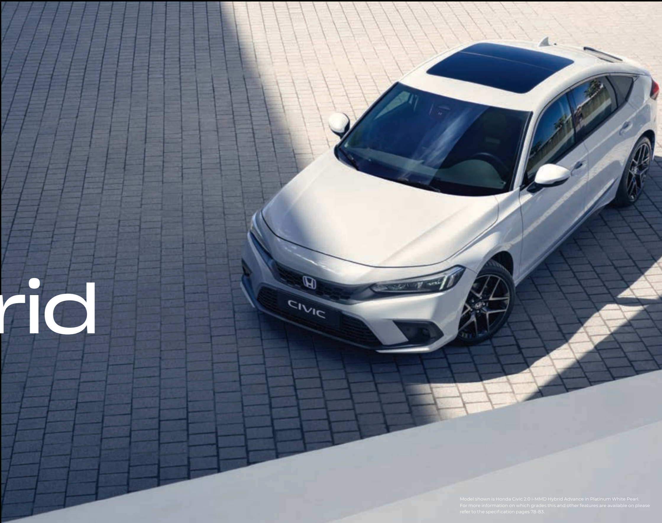
Model shown is Honda Civic 2.0 i-MMD Hybrid Advance in Platinum White Pearl. For more information on which grades this and other features are available on please refer to the specification pages 78-83.