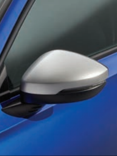
DOOR MIRROR COVERS Continue the Nordic Silver theme with these matching Door Mirror Covers.