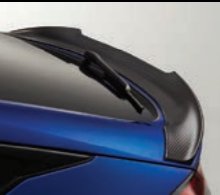
DUCKTAIL SPOILER The Carbon Style finish Ducktail Spoiler creates a sporty look to the tailgate.