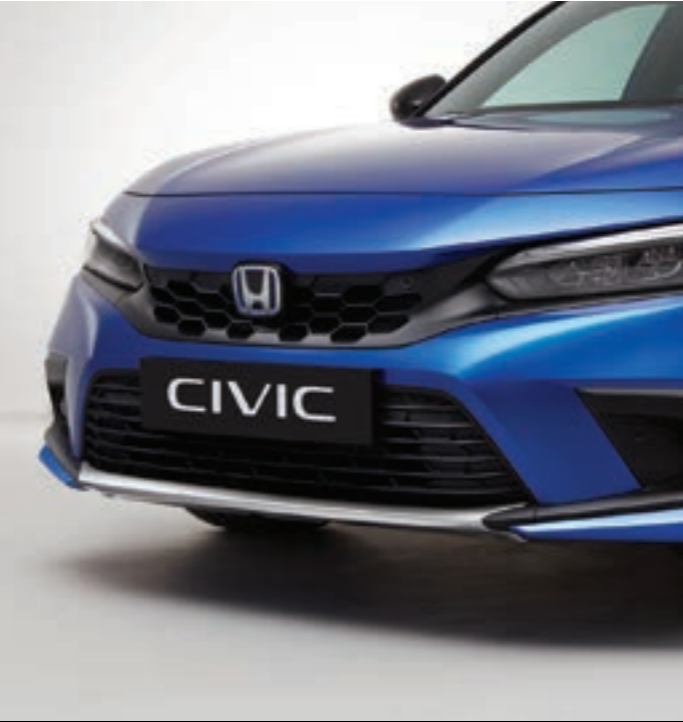
FRONT AND REAR LOWER DECORATIONS The Front and Rear Lower Decorations add a sleek metallic signature to the car's profile.