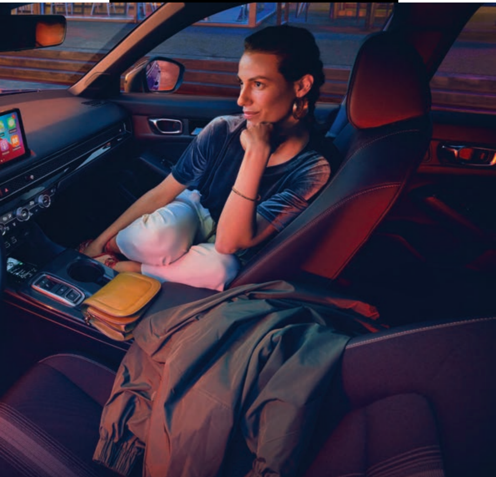
Model shown is Honda Civic 2.0 i-MMD Hybrid Sport in Premium Crystal Blue Metallic. For more information on which grades this and other features are available on please refer to the specification pages 78-83.