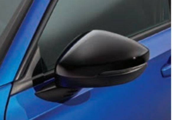
DOOR MIRROR COVERS Add a little uniqueness with these stylish Door Mirror Covers in Berlina Black.