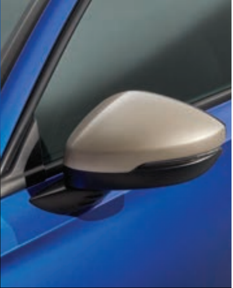
DOOR MIRROR COVERS Door Mirror Covers in Ilmenite Titanium complete the look.