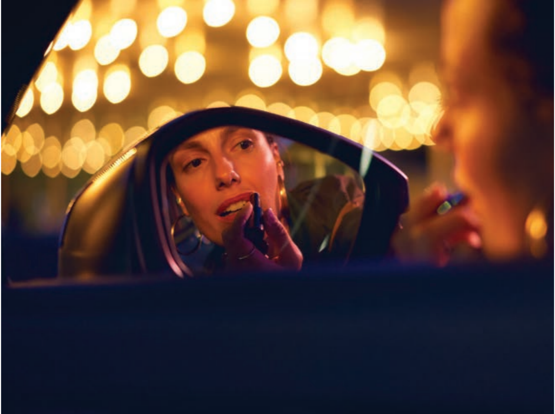
The Honda Civic