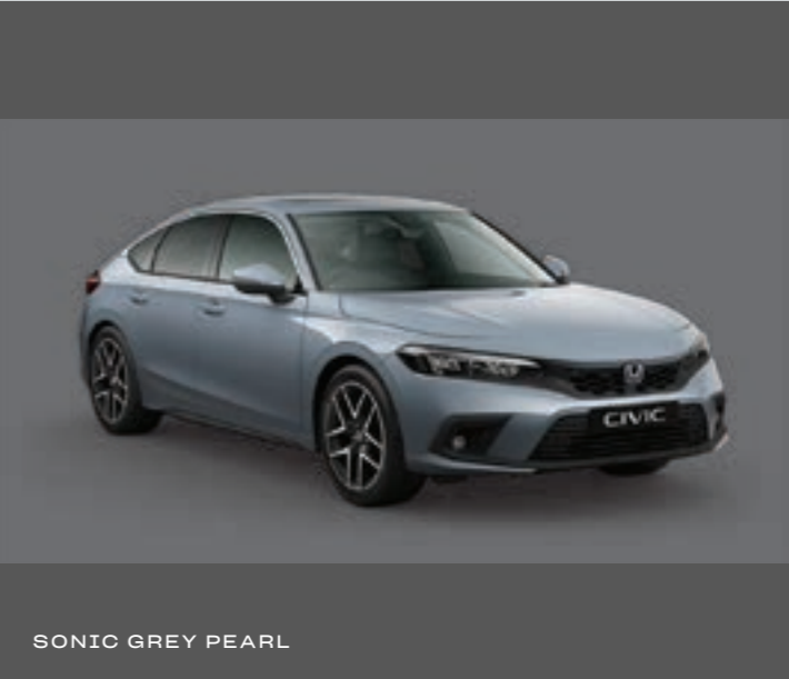
SONIC GREY PEARL