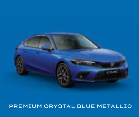
PREMIUM CRYSTAL BLUE METALLIC