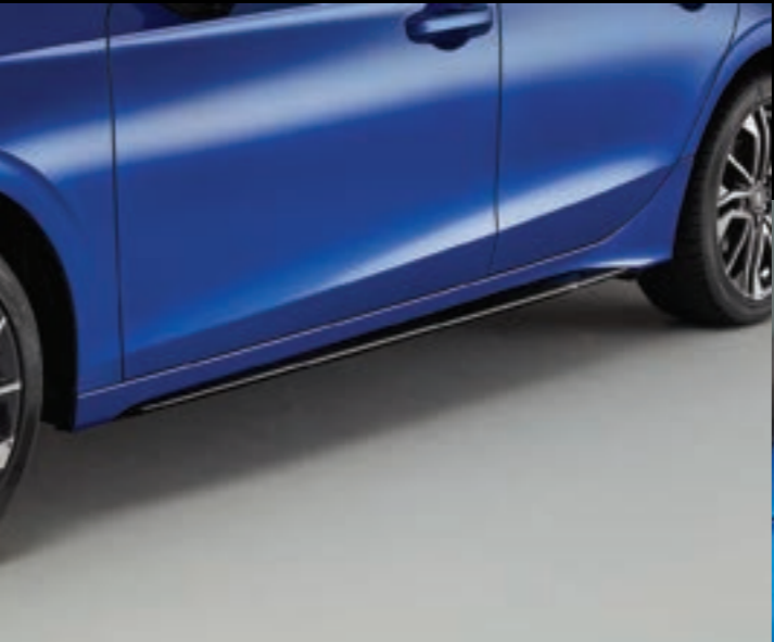
SIDE LOWER DECORATIONS These Berlina Black Side Lower Decorations give a muscular look to your car.