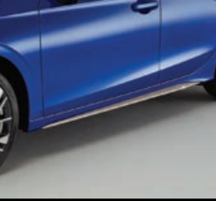
SIDE LOWER DECORATIONS The gleaming Ilmenite Titanium Lower Decorations create sporty refinement.