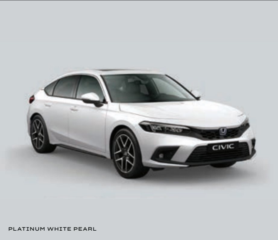
PLATINUM WHITE PEARL