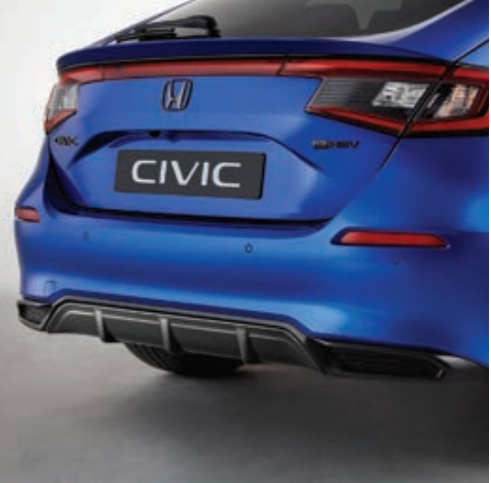
FRONT AND REAR LOWER DECORATIONS The Front and Rear Lower Decorations add a sporty and dynamic profile to your car.