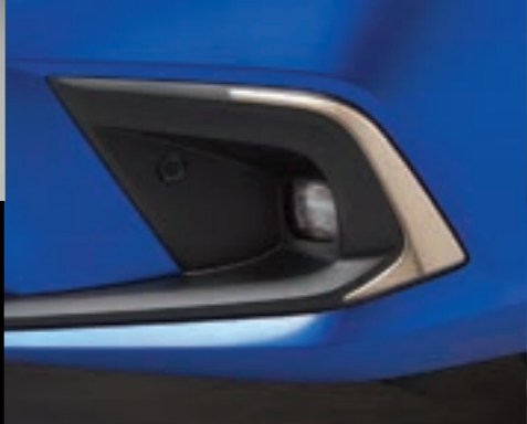
FOG LIGHT DECORATIONS The Fog Light Decorations in Ilmenite Titanium add another stylish touch.