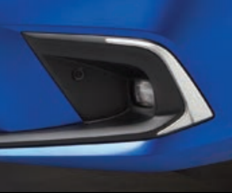
FOG LIGHT DECORATIONS The silver Fog Light finish creates a sharp stand-out detail perfectly enhancing the front view of your Civic.