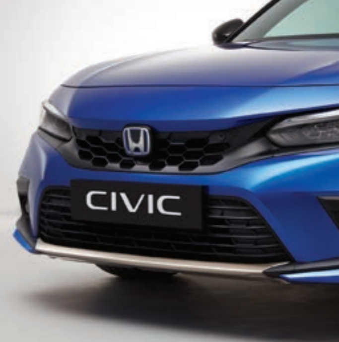
FRONT AND REAR LOWER DECORATIONS Further sharpen the features of your Civic with the Front and Rear Lower Decorations.